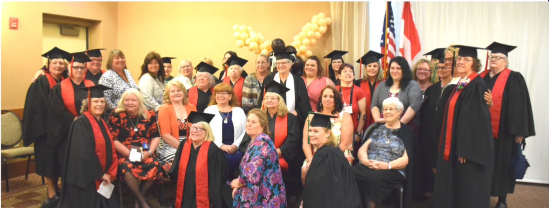
2018 Green Cap Junior Graduate Regent and Capping Officers.