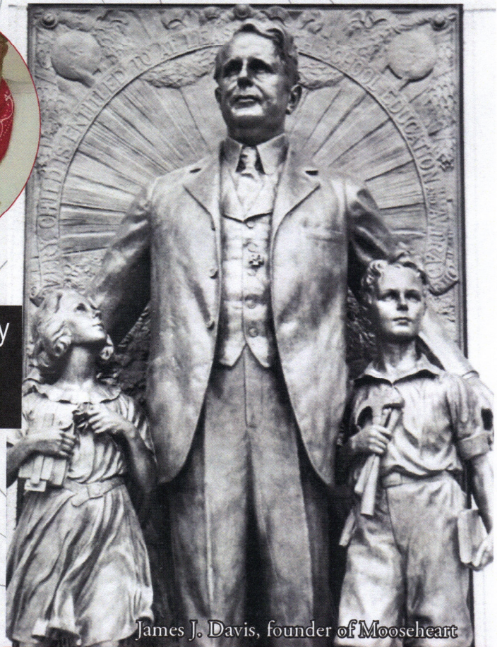
James J. Davis, founder of Mooseheart

Please wear your Donors Circle pin proudly and share the story of Mooseheart & Moosehaven at every opportunity.