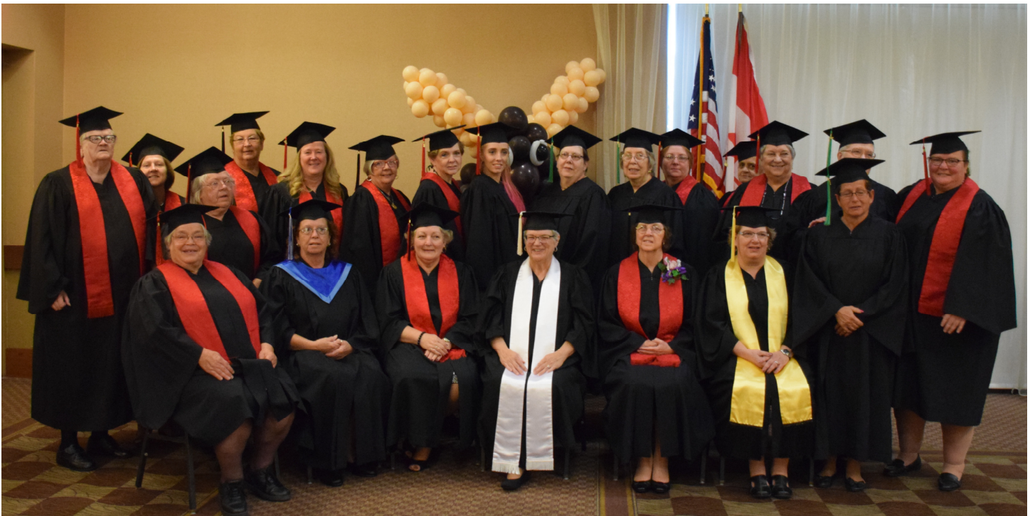
W.O.T.M. Dignitaries at Annual Convention in Liverpool, NY 2018